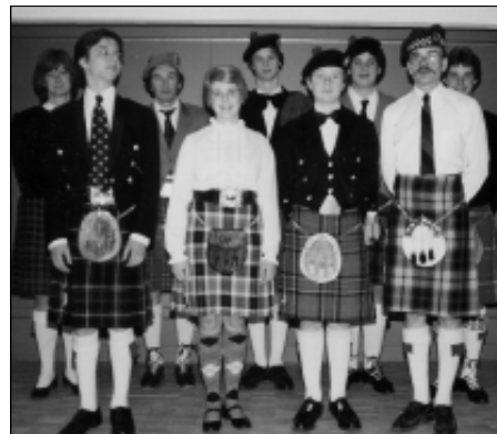
The group photo of the competitors for the 1982 Nicol-Brown Chalice included two of the judges for the 2008 contest.

The Nicol-Brown Chalice, Inc. is a 501(c)(3) non-profit organization.